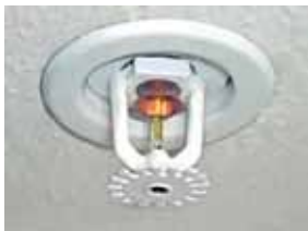
Example of a standard non-concealed sprinkler head.