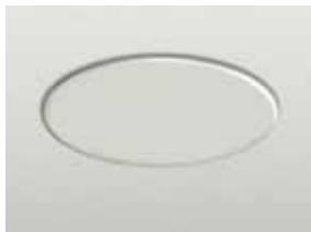
Example of a home fire sprinkler concealed by a cover plate.

For more information about home fire sprinklers, contact your local fire department or visit: www.oregon.gov/osp/sfm/comm_ed_sprinkler_information.shtml .