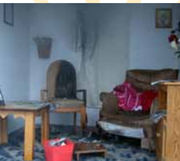
Demonstration of the extent of damage in a room protected with a home fire sprinkler.