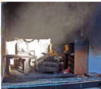
Demonstration of the extent of damage in a room not protected by a home fire sprinkler.